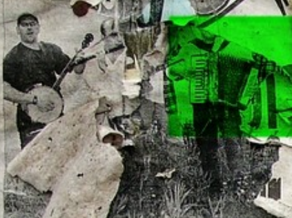
Die Schöne scham de Folk im Osten skandinav. Zwischen 200 und 1000 besetzt sch.